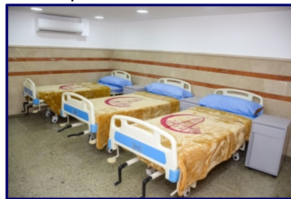
(Indoor Accommodation Rooms)