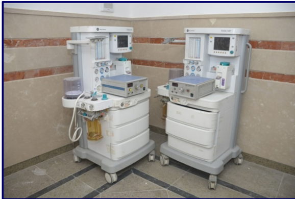
(Anesthesia Devices for Brain Synchronization Therapy (BST) Sessions)

stages of their treatment consist of supervision, following up their overcoming of the withdrawal symptoms from the substance, followed by the start of psychotherapy sessions for this disorder in the form of individual and group therapy treatment until their conditions stabilize and they are discharged to complete the treatment program in the outpatient clinics.