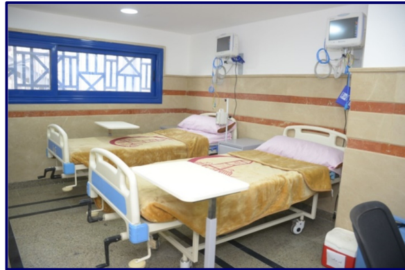
(Intermediate Psychiatric Care Unit)