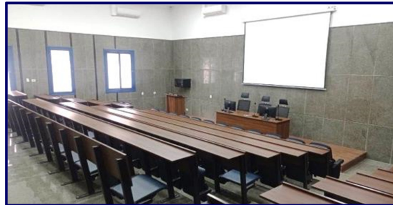
(Prof. Tarek Asaad Hall)