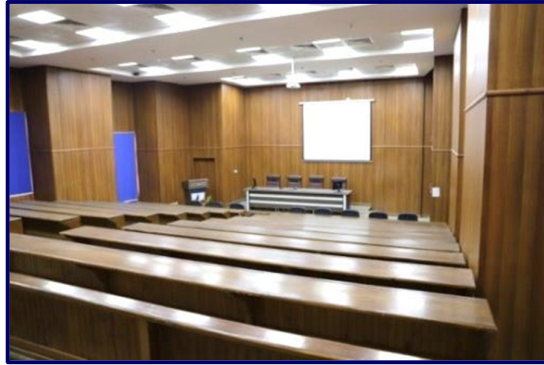
(Prof. Ahmed Okasha Auditorium)