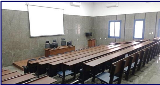
(Prof. Adel Sadek Hall)