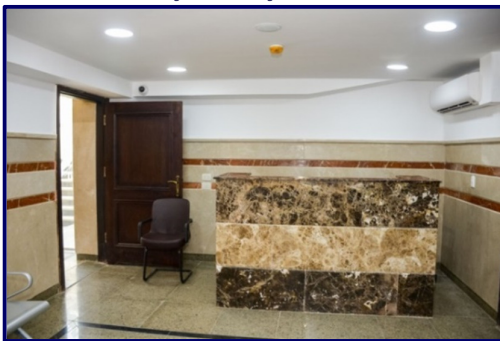
(Outpatient Reception Counter)