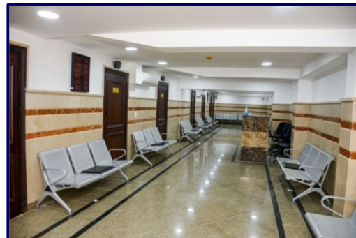
(Outpatient Waiting Hall)